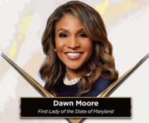
Dawn Moore First Lady of the State of Maryland